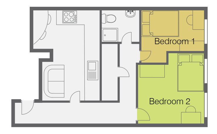
Flat 5 Floor 2