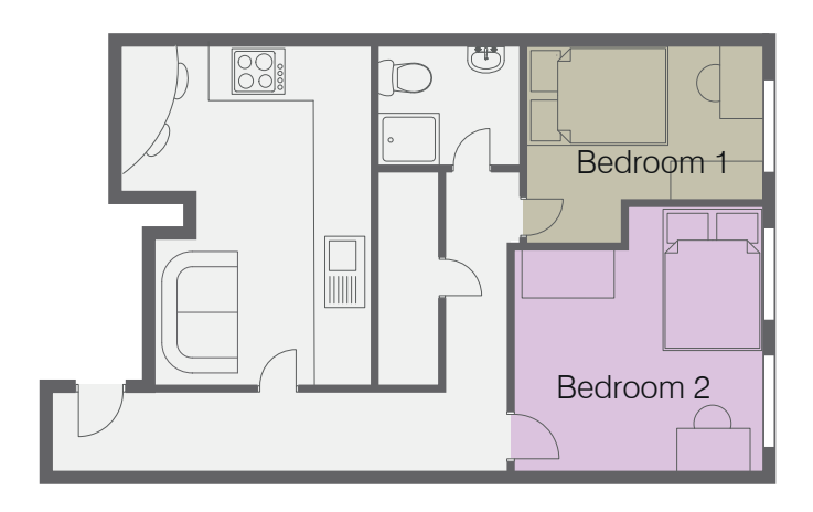
Flat 3 Floor 1