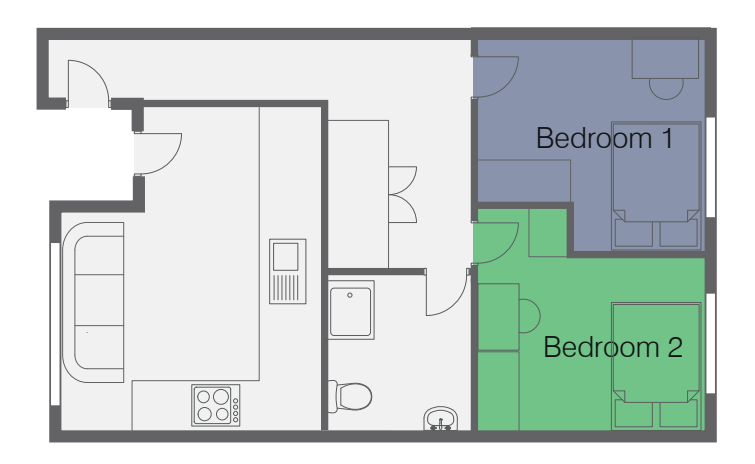
Flat 6 Floor 2